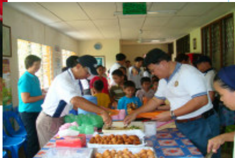
Good food and fellowship.