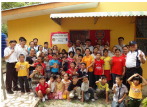
Official opening of the Mini library.