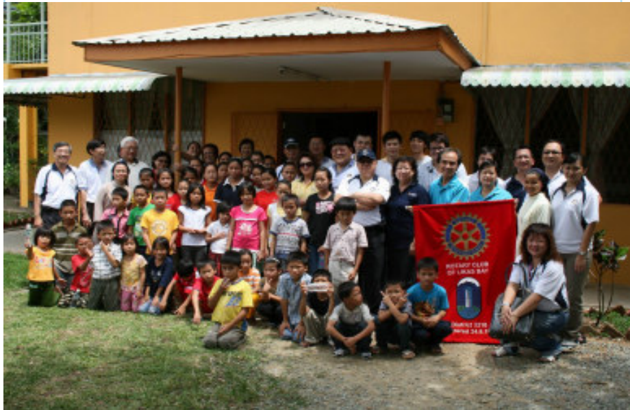
Group photo of Rotarians and the children of St. Theresa Children's Home in Kota Marudu.