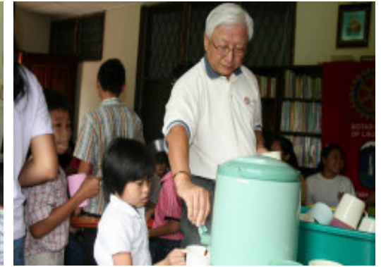
Rotarians and children enjoying the refreshment.