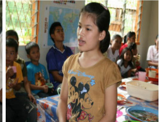
Story telling by one of the children.