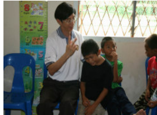
Fellowship with the children.