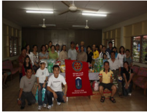
Group photo of Rotarians and family members at the Home.