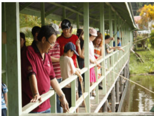
Rotarians and family members milling around the bridge trying to catch some fish!