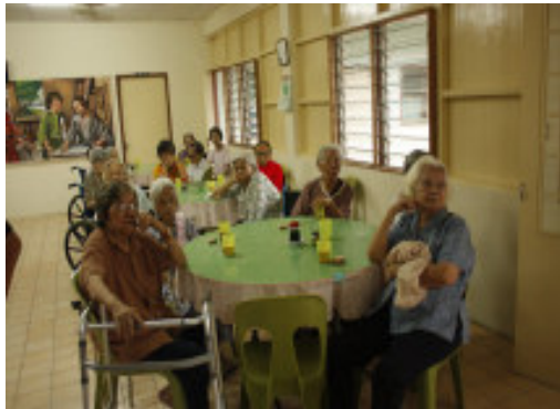
Residents of the Holy Family Home in Papar.