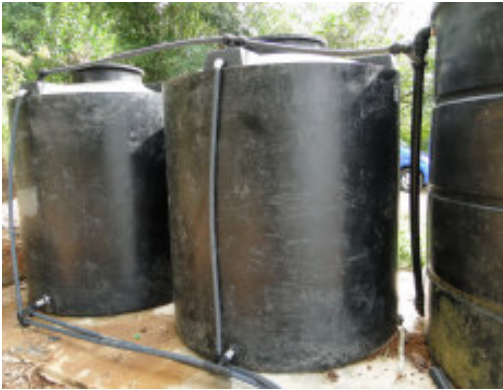
Kg. Lapan water tanks fully connected and filled with fresh water.