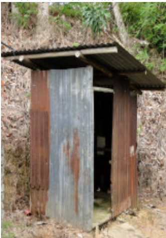
The old pit latrine behind the kindergarden and the new flush toilet at Kg. Lapan..