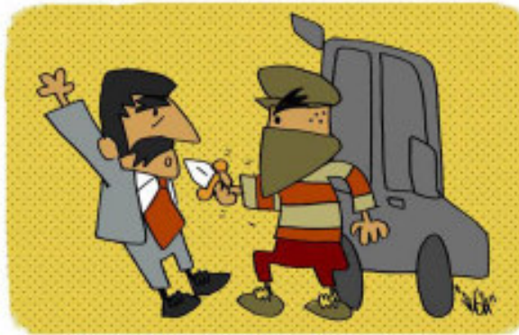
10 bags of rice or my car full tank!! which one??