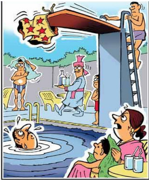
Your diving and driving are the same...Always scraping past the edges!

My Doctor said "Only 1 glass of alcohol a day". I can live with that.