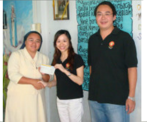
The Rotaract Club of Likas Bay did their bit of Charity work last weekend when they visited the Tambunan Orphanage and presented some gifts in both in cash and in kind for the running of the home.