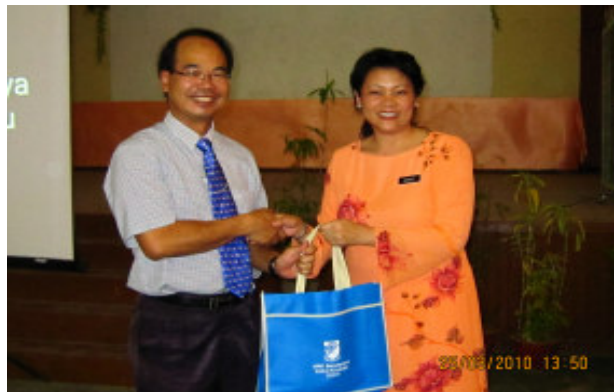
SMK Bandar Raya Interact Club Installation on 25th March.