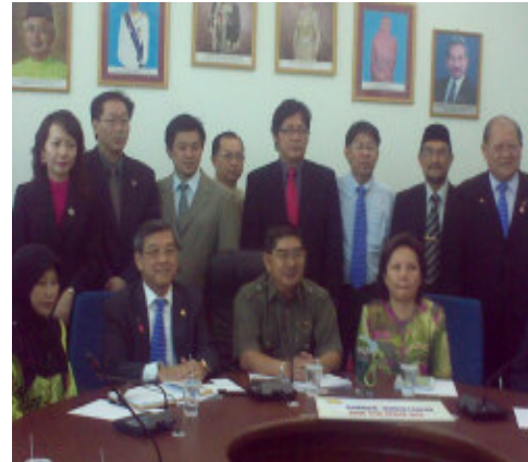
SINDEX - courtesy call on YB Datuk Dr. Maximus Ongkili.